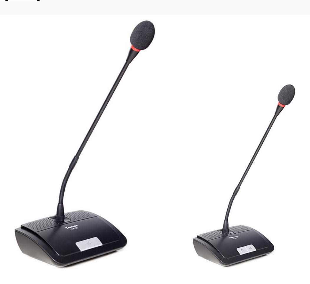
YARMEE-YC836C/D Desktop Microphone unit